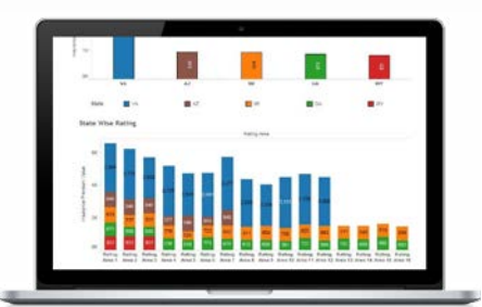
Figure 5, 6: State-wise premium rates and rating areas classification

This granular report depicts the top 5 states which offer maximum number of premium options for user demographic – 50 years. The plans are further classified according to rating areas 1-60.