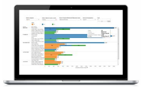
Figure 7, 8, 9: Drill down reports

eInfochips is a premier Tableau alliance partner for integrating Tableau capabilities to vertical industry solutions across Retail, Manufacturing, Utilities, and also the Healthcare. eInfochips has proven expertise and customization/integration solutions for companies that have adopted, or are looking to adopt Tableau.